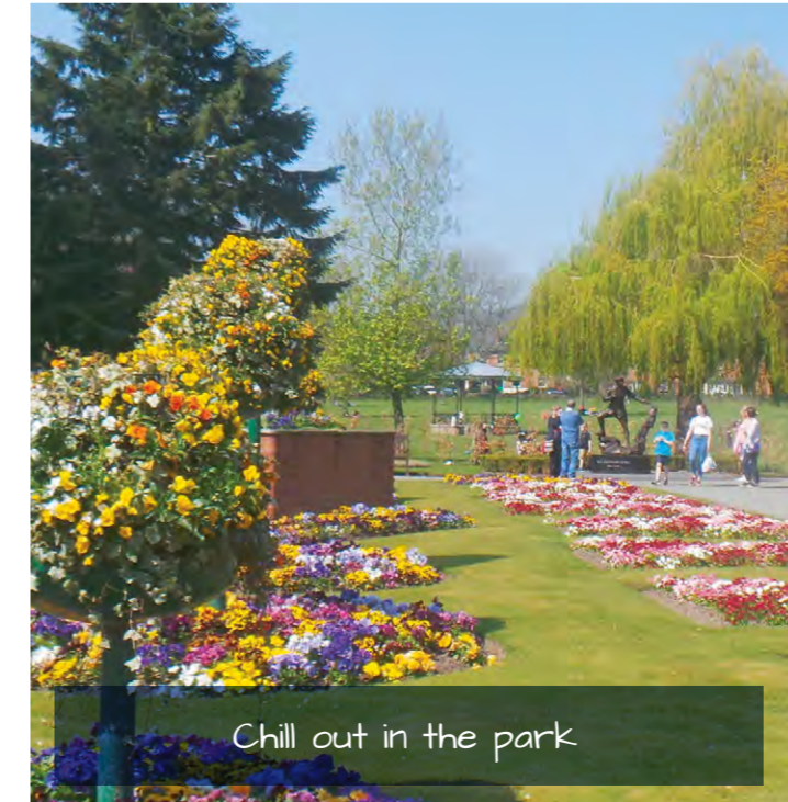
Chill out in the park