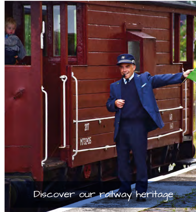
Discover our railway heritage