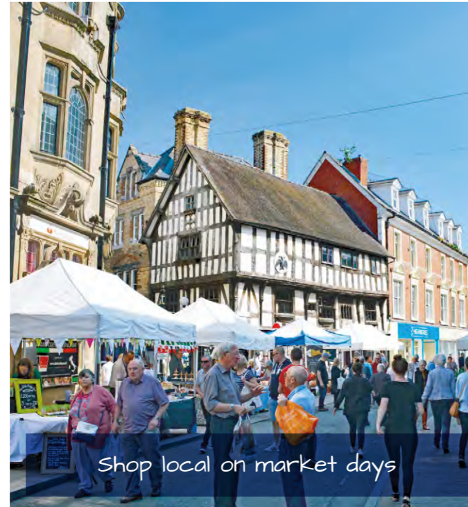
Shop local on market days