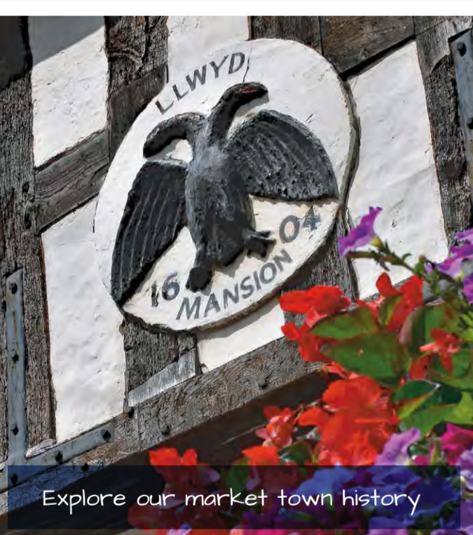
Explore our market town history