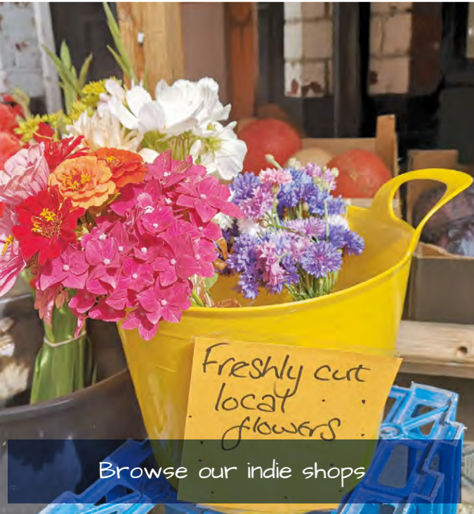
Browse our indie shops