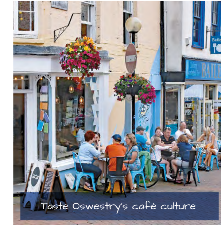
Taste Oswestry's café culture